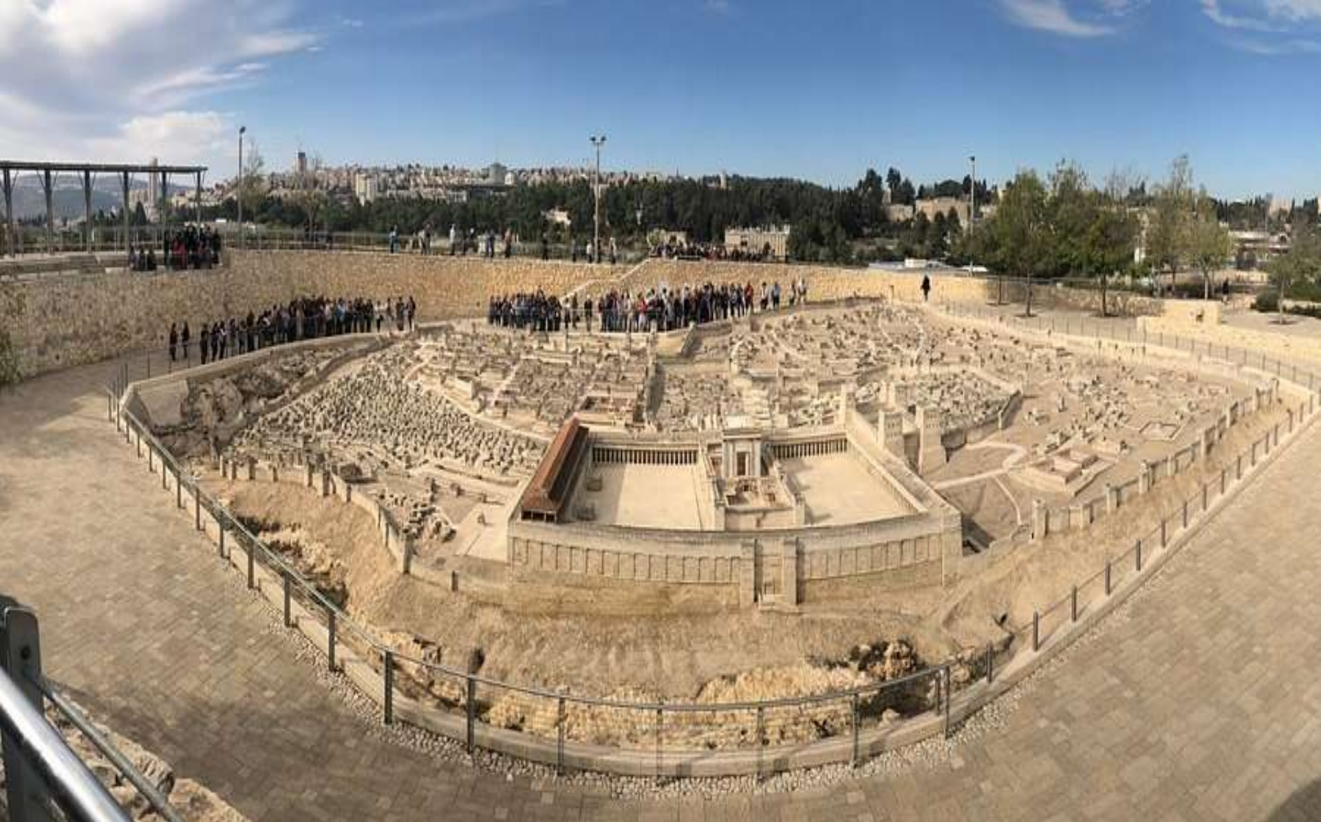
Jerusalem and Temple scale model during Jesus ministry