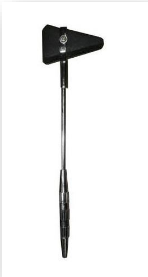
PERCUSSION KNEE HAMMER