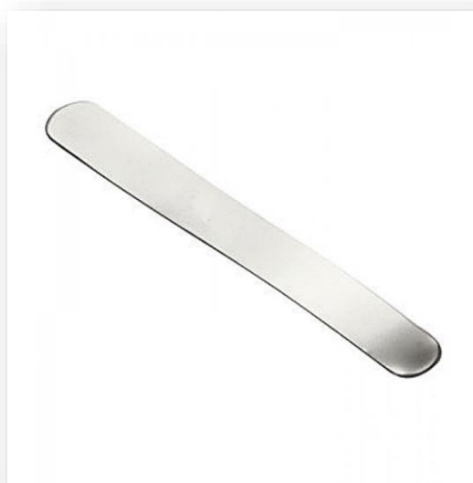
STEEL TONGUE DEPRESSOR