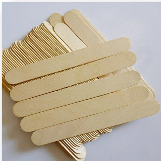
WOODEN TONGUE DEPRESSOR