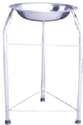
WASH BASIN STAND