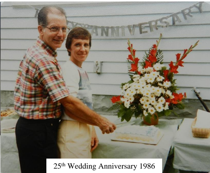
25 th Wedding Anniversary 1986