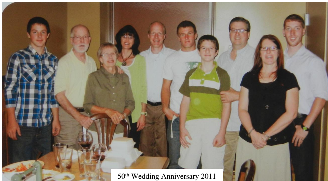
50 th Wedding Anniversary 2011