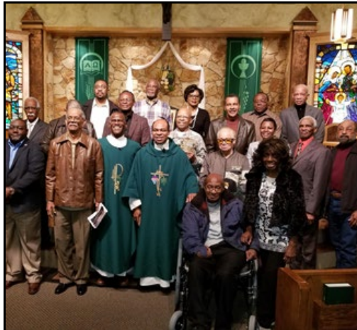
U.S. Military Veterans were honored at the 10:00am Mass on Veterans Day, Sunday November 11, 2018.