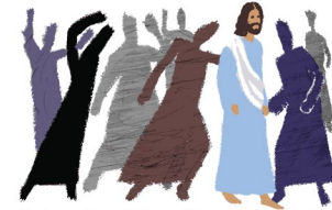
An Angry Crowd Tries to Throw Jesus Off a Cliff

Jeremiah is called to preach God's word. God fortifies him against the opposition he will face. Jesus also meets opposition in his hometown, and he must move on. The Corinthians in the Second Reading were alternately jealous and dismissive of others' spiritual gifts. Paul preaches to them that love is more important than any spiritual gift, for without love nothing else matters.