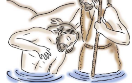
L u k e 3 : 2 2

And a voice came from heaven: Today's first reading and Gospel feature nearly the same words from God. Centuries before Christ's birth, Isaiah says God proclaims, "Here is...my chosen one with whom I am pleased." When Jesus was baptized, the Father spoke from heaven, "You are my beloved Son: with you I am well pleased." Let us listen to how Isaiah, Peter, and Luke speak of God's chosen one: the Messiah, the Christ God's Son.