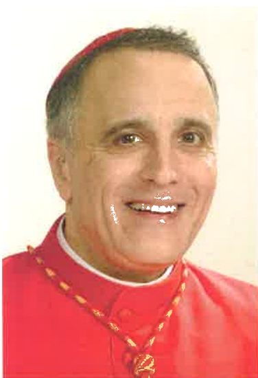
His Eminence Daniel Cardinal DiNardo PRINCIPAL CELEBRANT

Honoring the birthday of Rev. Dr. Martin Luther King, Jr.