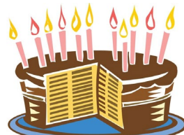
Our Pastor's Birthday