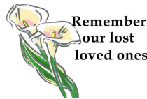
Remember our lost loved ones

Families are invited to sign up again this year to be Advent Candle Lighters during the four (4) weekends of Advent, beginning the weekend of November 30 th & December 1 st and ending the weekend of December 21 st & 22 nd . We have four (4) Masses each weekend, so we will need to have sixteen (16) families. The Sign-up sheet will remain in the vestibule of the church until all 16 slots are filled.