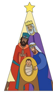
A Light to the Nations