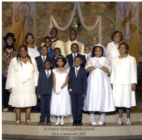
St. Francis Xavier Catholic Church First Communion 2021