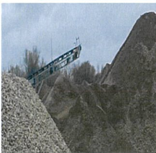
Create dust and fine particle pollution