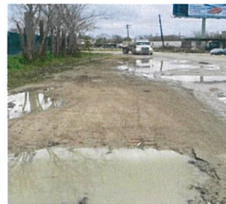
Damage our Roads