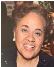
SIS Gloria Alridge St. Ignatius of Loyola

Register online at https://olsoshoustontx.flocknote.com/signup/221744 or scan QR code