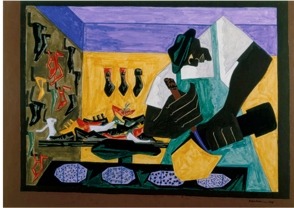
Jacob Lawrence The Shoemaker 1945

For many Black artists, abstraction has served as a potent tool for exploring and expressing their cultural identities. Artists like Jacob Lawrence and Bob Thompson utilized abstract elements to depict scenes from African American life, challenging prevailing narratives and stereotypes. Their works reflected a deep understanding of the complexities of Black identity, using abstraction to transcend limitations and create a space for self-affirmation