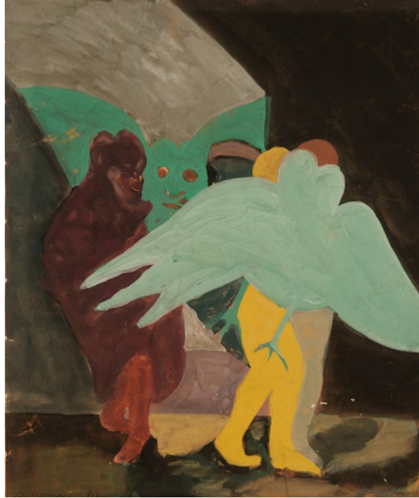
Bob Thompson Untitled 1962