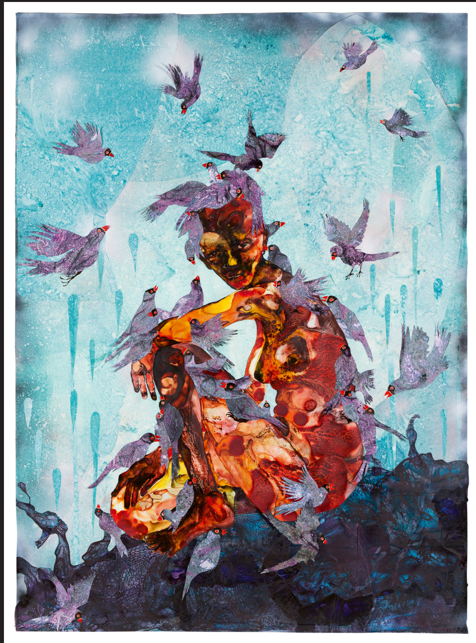
Wangechi Mutu, Ox Pecked , 2018