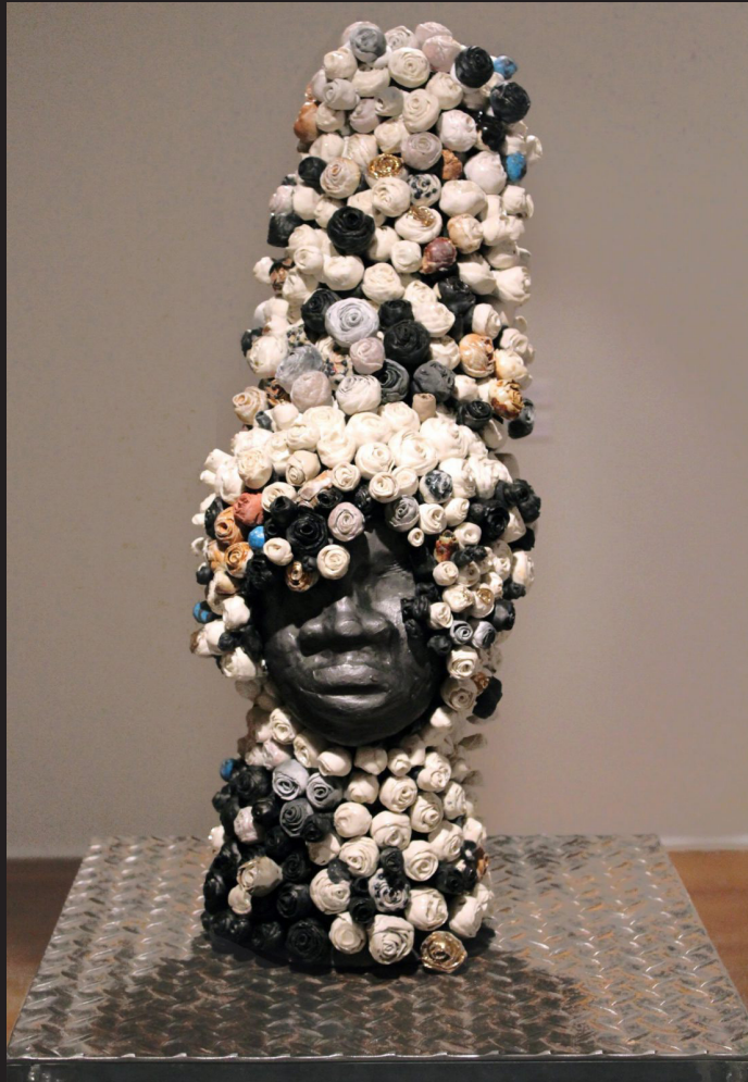
Simone Leigh "Whats Her Face"