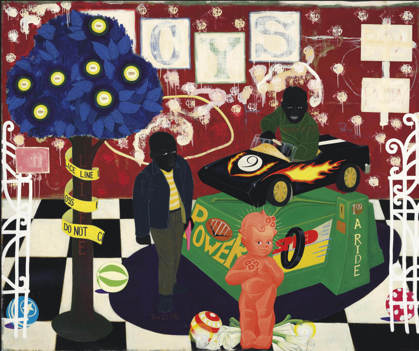
The Lost Boys Kerry James Marshall