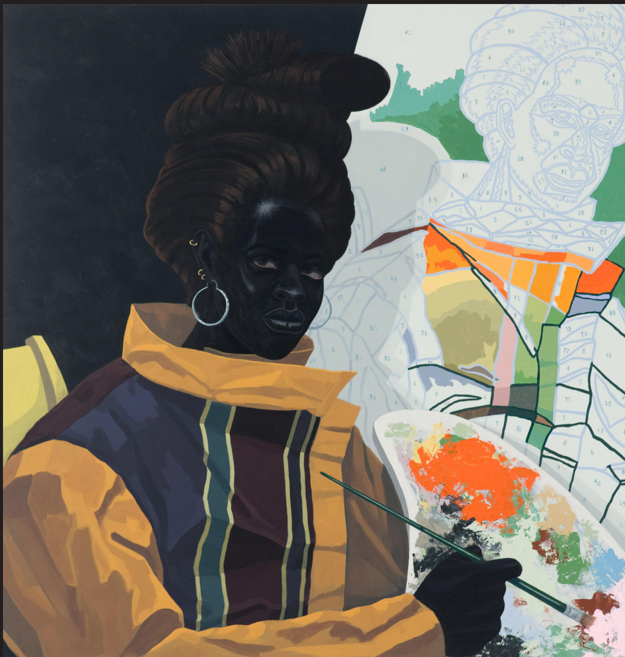
Kerry James Marshall. Untitled (Painter) , 2009. Acrylic on PVC panel, 44 5/8 × 43 1/8 × 3 7/8 in. (113.3 × 109.5 × 9.8 cm). Museum of Contemporary Art Chicago, gift of Katherine S. Schamberg by exchange, 2009.15 © Kerry James Marshall Photo: Nathan Keay, © MCA Chicago.