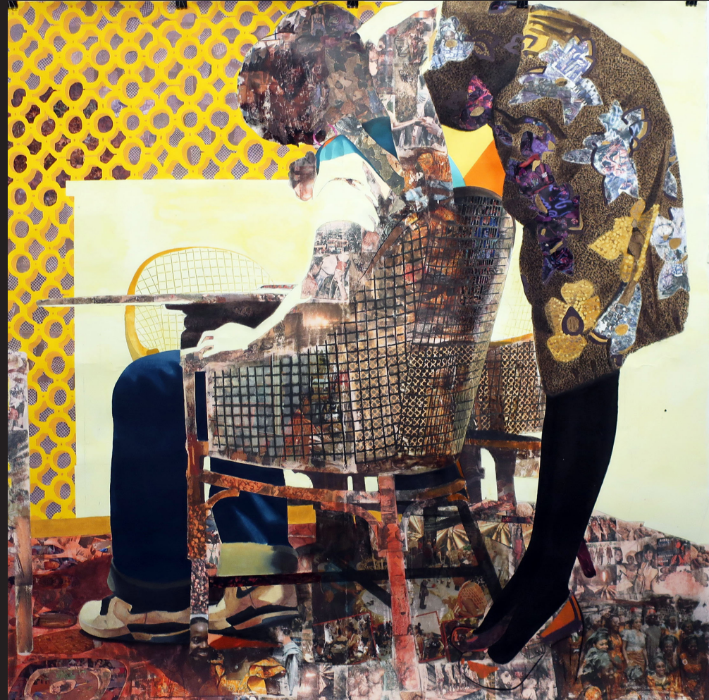
Njideka Akunyili Crosby “Side by Side”