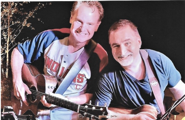
They still play after all these years.