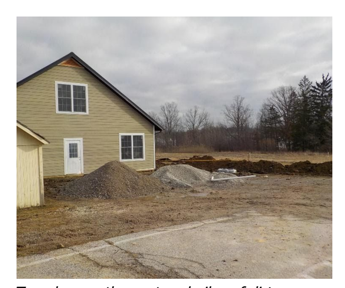
Trenches on the east and piles of dirt are becoming familiar sights at the farm

Of course, we have some repairs to do around the old buildings of the farm, as well. The handicapped ramp railings will need to