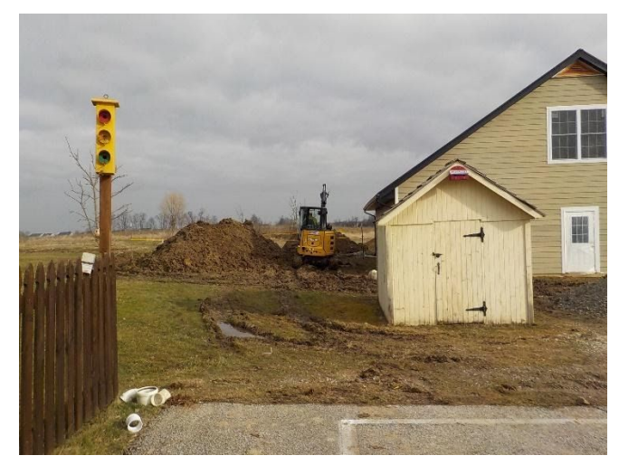
A little muddy, but work continues, west of the building

Superintendent Michael Mayell is asking the school contractors to help wherever possible as we also bring bits and pieces to the building to re-create our classroom.