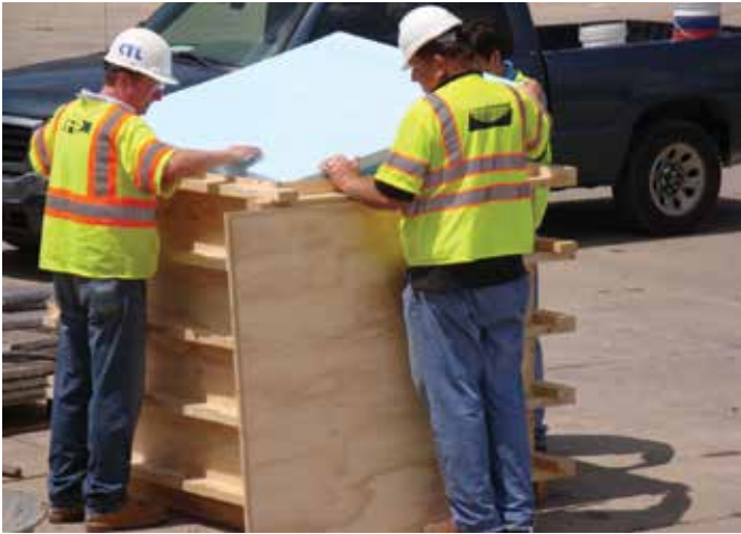
Fig. 3: After the form was filled with concrete, the top surface of the test cube was covered with three layers of 2 in. (50 mm) extruded polystyrene board insulation. The joints in the layers were staggered to prevent convective heat transfer or infiltration (refer to Fig. 1)