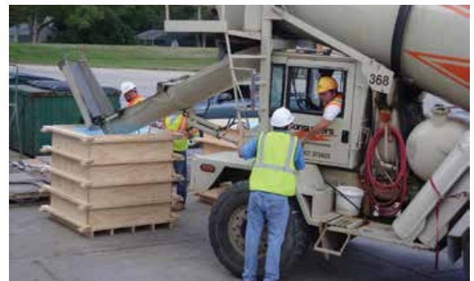
Fig. 2: Concrete placement for a 3 x 3 x 3 ft (0.9 x 0.9 x 0.9 m) specimen

Figure 5 presents the calculated adiabatic temperature rise of the concretes. The adiabatic temperature rise was corrected for maturity based on the Arrhenius equation in ASTM C1074-11, “Standard Practice for Estimating Concrete Strength by the Maturity Method,” and an activation energy of 33,500 J/mol.