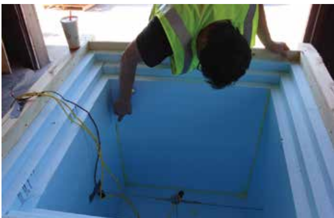
Fig. 1: The plywood form was lined with three layers of 2 in. (50 mm) extruded polystyrene board insulation and the joints of the inner layer were sealed with foam-in-place insulation. The temperature sensors are mounted on fixed plastic rods located near the center of one face and the center of mass of the final specimen

cylinders tested per ASTM C39/ C39M-14, “Standard Test Method for Compressive Strength of Cylindrical Concrete Specimens.”