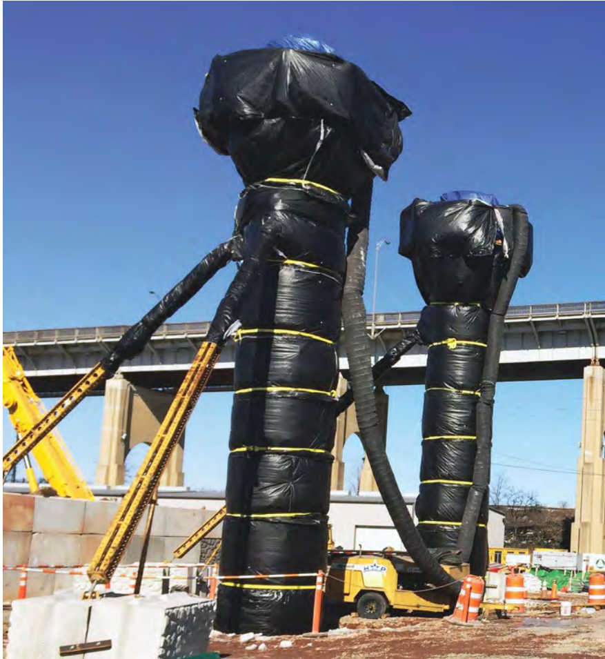
Insulated columns for a bridge project.