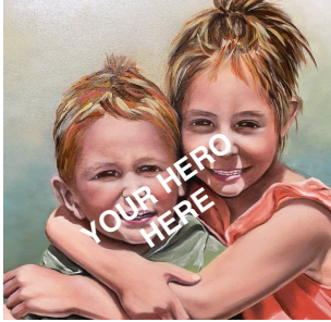
Portraits will meaningfully depict the image and personality of the subject.

The Jack Long Foundation's Elderhouse prototype is focused on people, in particular vulnerable seniors, living life with dignity. Elderhouse's Legacy Recognition Program offers a unique opportunity for donors to pay homage and create a lasting memory of someone special in their lives, and tell their story. Maybe it's an unsung hero who worked quietly behind the scenes for family, friends, neighbours, or their community or maybe it's a well known game changer, maybe it's your mom or dad! Let's celebrate their memory!