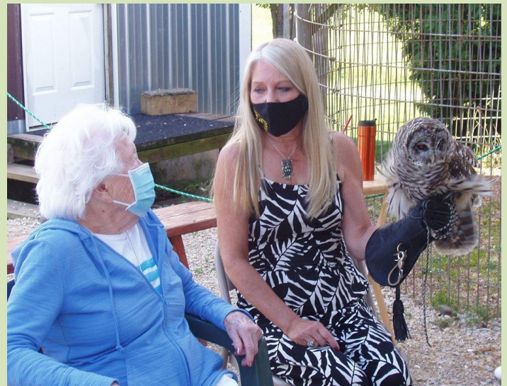
Birthday wish for Connie "99" to meet "Clark" our education barred owl