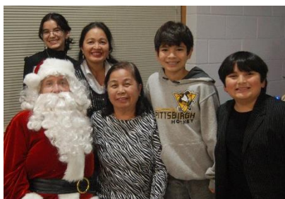
Christmas Potluck Dinner 2023 Friendship, food, Prizes, and a visit from Santa