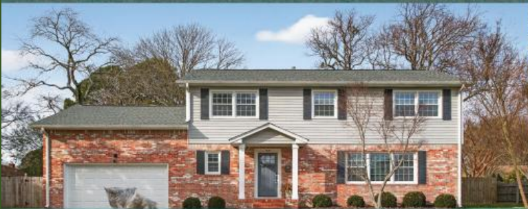
Walt Whitman Way Sold $600,000