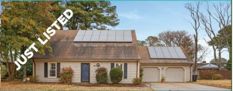
4652 Truman Lane Offered at $585,000