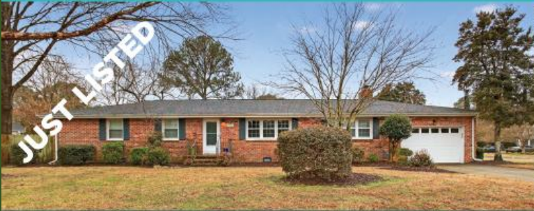
4633 Copperfield Rd Offered at $525,000