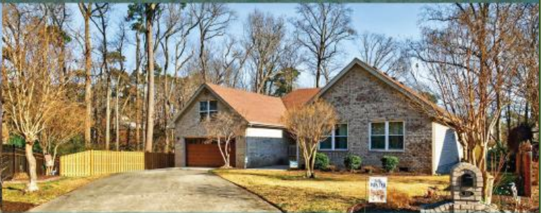
Mariposa Ct Under Contract offered at $610,000

Selling the most homes in your neighborhood!