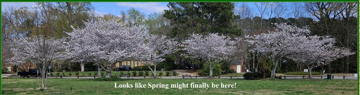
Looks like Spring might finally be here!