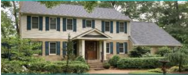
De La Fayette Ct Sold $900,000