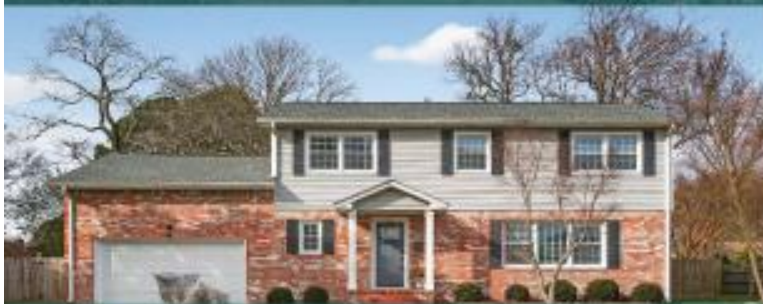
Walt Whitman Way Sold $600,000