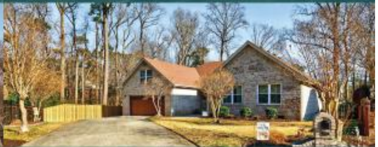
Mariposa Ct Under Contract offered at $610,000

Selling the most homes in your neighborhood!