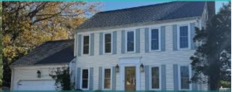
Spring Tree Ct Sold $625,000