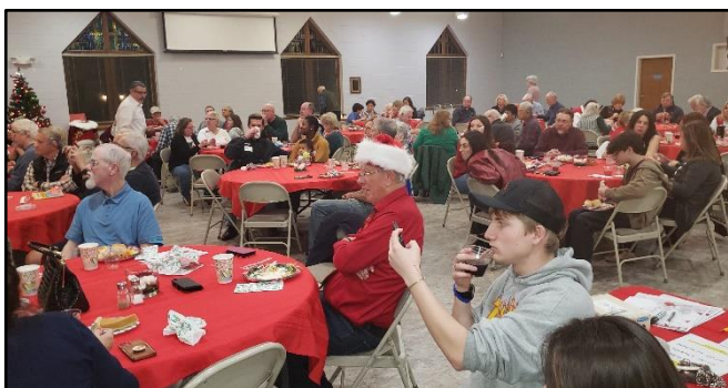
2024 Annual Civic League Christmas Party

The greatest deterrent to a would-be criminal is the fear of getting caught. Each concerned citizen is another pair of eyes to let the criminal know that he is being watched. Neighborhood Watch supplies these eyes.