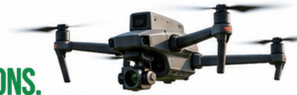
Image Surveys Limited provides professional drone mapping, inspections and data services across the UK, helping organisations make informed, confident decisions with accurate aerial intelligence.