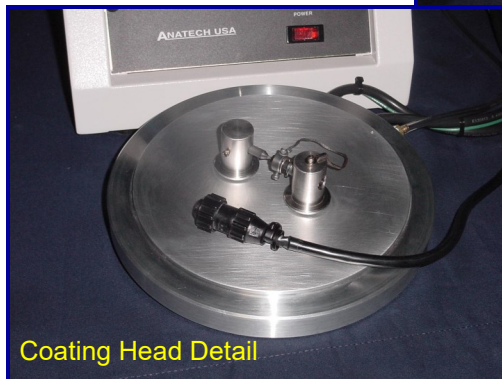
Coating Head Detail

Evaporate Carbon using your Hummer sputter coater. Available for Hummer models 6.2 and 6.6