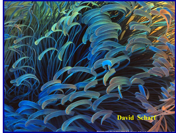
Mosquito Larva Hairs