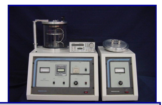
Hummer 6.6 with Carbon Evaporation Accessory and Thickness Monitor

System dimensions - 22" W x 29" D x 26" H Shipping weight - 120 lbs. estimated