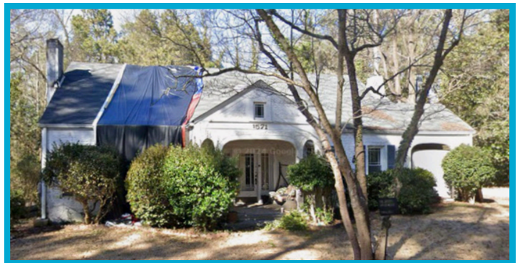
Current image of the Willis house circa February 2025.