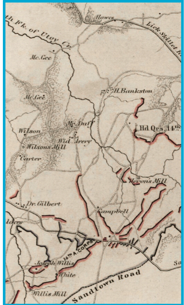
Portion of 1872 map illustrating the siege of Atlanta. (Herren's Mill is spelled incorrectly.)