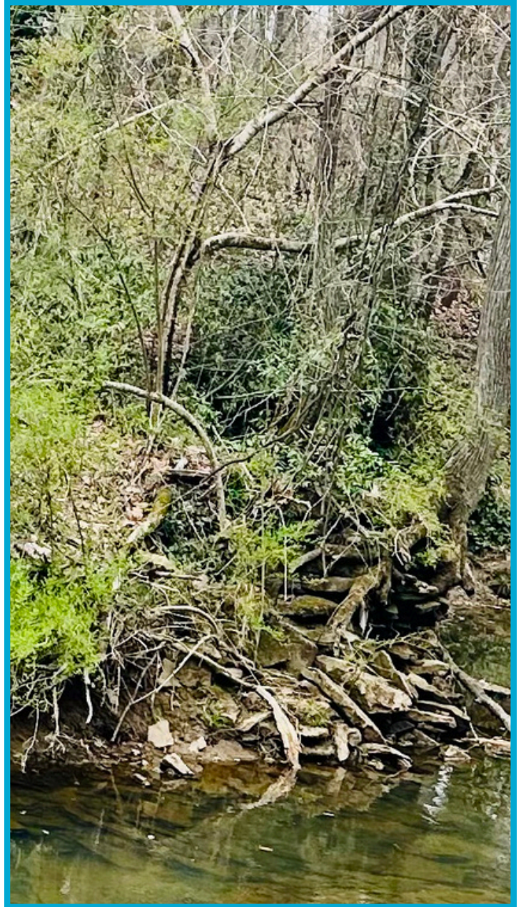
Photograph of Herren's Mill dam remnants on N. Utoy Creek.

Even General William T. Sherman, commander of Union forces in the Atlanta Campaign, recognized the strategic value of the mill dam. Historical accounts suggest Sherman himself visited the site, crossing the very dam to observe firsthand the terrain his soldiers were navigating. It was a quiet but vital moment in the effort to encircle and capture Atlanta.