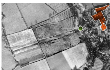
● Veteran Oak tree ■ Site of Gunnergate Hall

The cyclepath here runs through the site of the deserted medieval settlement of Newham. Earthwork remains were visible until the early 1970s. A hollow way leading from the village into the dell can still be seen.