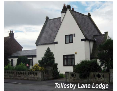
Tollesby Lane Lodge