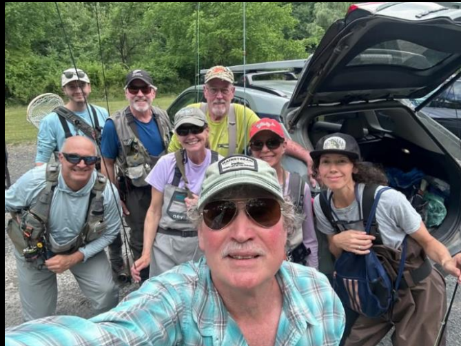
DVFF trip to Pohopoco Creek June 18, 2026