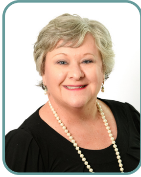
Message From GFWC-SC Secretary

If you are like me, you are so happy to back in the club season spending time with your club sisters and working side by side on projects. We are all busy with fundraisers, meetings and giving back to our community and the state. Don't forget to support your GFWC-SC sisters in their fundraisers as well.