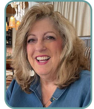
Message From GFWC-SC First Vice President

Merry Christmas everyone! As you're reading this, I will be unpacking from a major kitchen renovation...fingers crossed! If I'm not, it will be a very different Christmas than what we've planned.