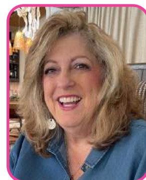
Message From GFWC-SC First Vice President

As we move into spring, it is a great time for your club members to review your club's by-laws, projects, fundraisers, new member recruitment, etc. Club and club dynamics change, and you need to look at how your club is set up and determine if it still works NOW. If not, work with each other to find the best way to go forward. Change your by-laws, look for new projects and fundraisers, brainstorm ways to get new members in your club. It's very easy to keep doing things the way we always have but get out of your comfort zone and embrace some change!