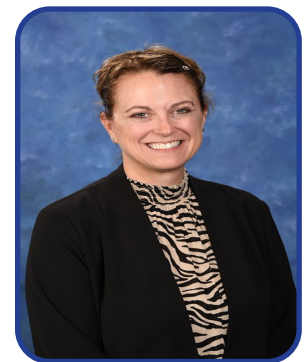
Message From GFWC-SC