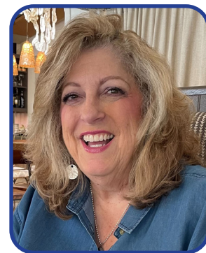
Message From GFWC-SC President-Elect