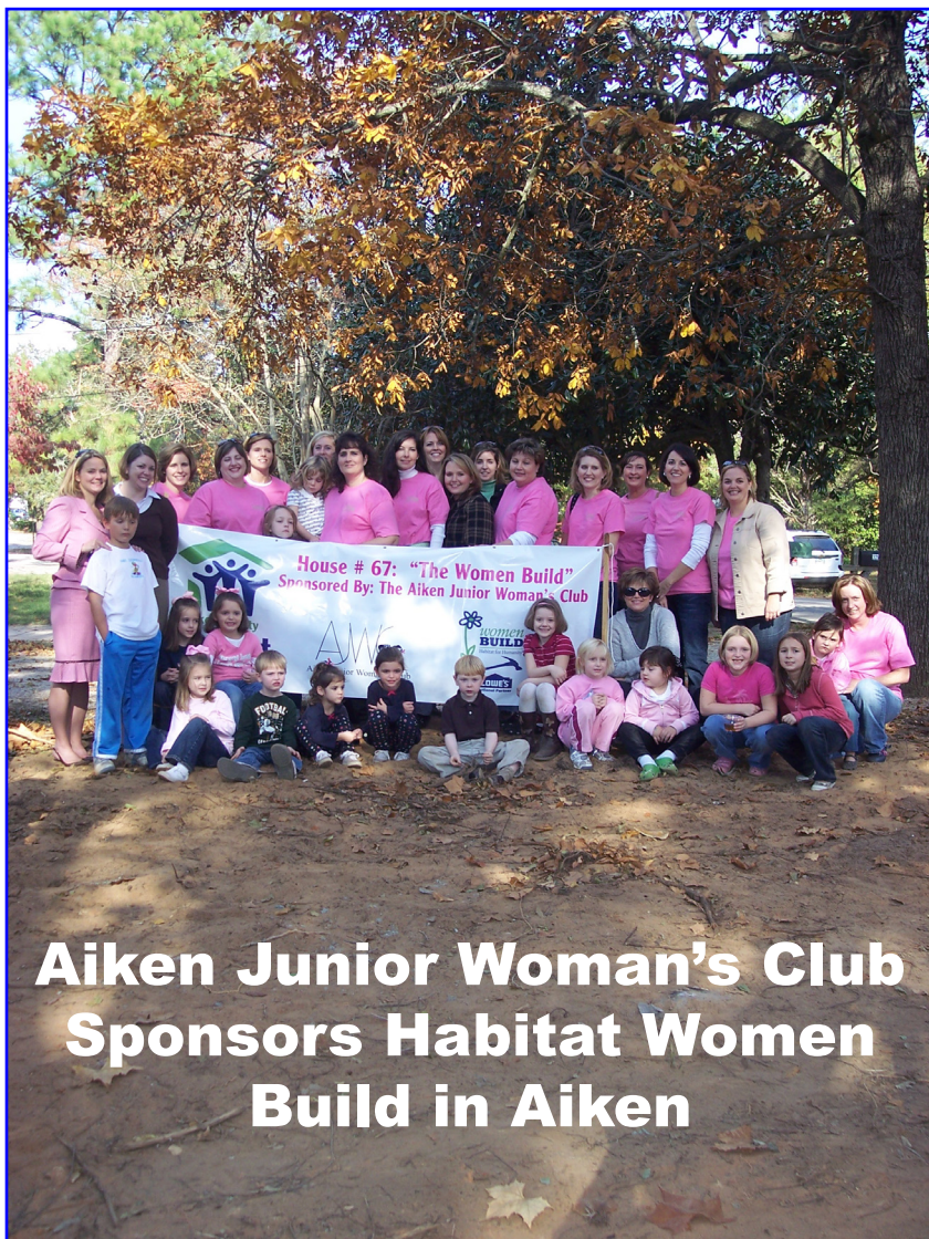
Aiken Junior Woman's Club Sponsors Habitat Women Build in Aiken