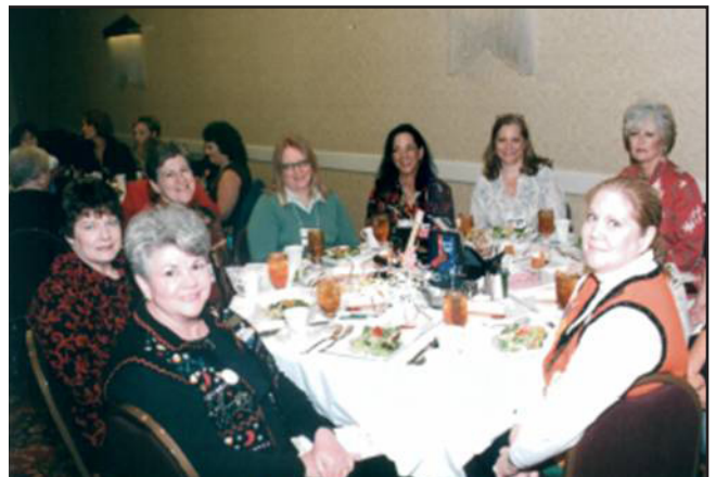
Federation Friends share a meal