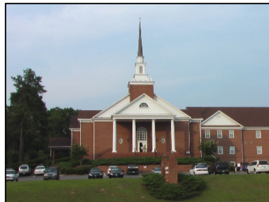
St. Andrews Presbyterian Church 6952 St. Andrews Rd. Columbia, South Carolina 29212