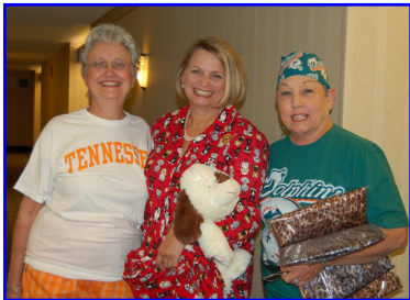
Our region sisters from Florida