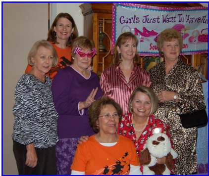
Wear One, Share One Pajama Party for Domestic Violence Shelter