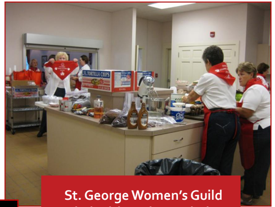
St. George Women's Guild Salad With Style Fundraiser