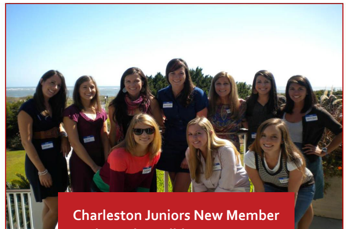
Charleston Juniors New Member Orientation Wild Dunes Resort