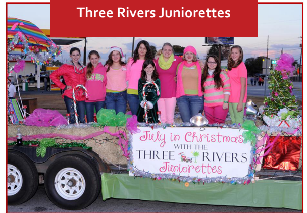
Christmas Parade Three Rivers Junioresettes