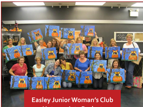
Easley Junior Woman's Club Uptown Arts Project