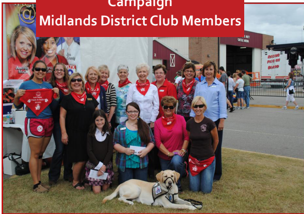
SC State Fair—Paws In Action Campaign Midlands District Club Members