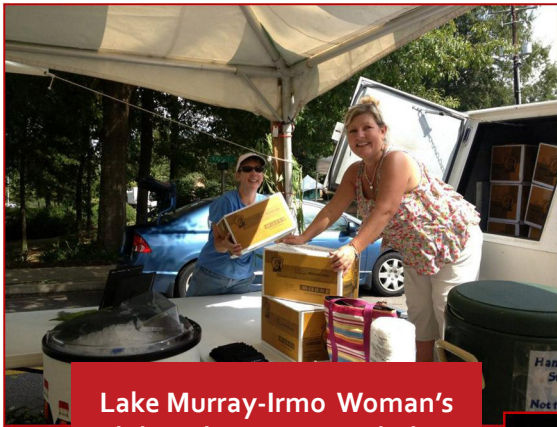
Lake Murray-Irmo Woman's Club - Okra Strut Fundraiser