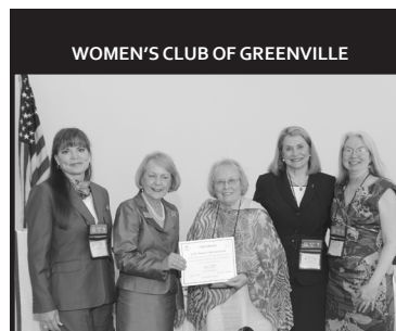
WELCOME TO OUR TWO NEW CLUBS FEDERATED AT 2014 CONVENTION