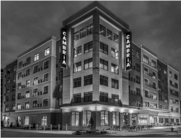
Cambria Hotel Rock Hill - University Center Reservations: 803-324-0004