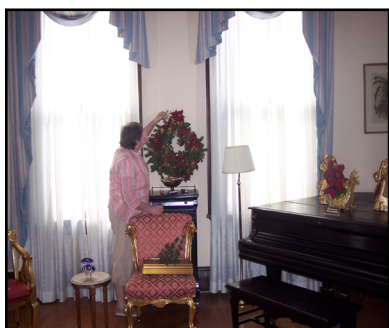
Elves ? at Headquarters decorating for the Holidays