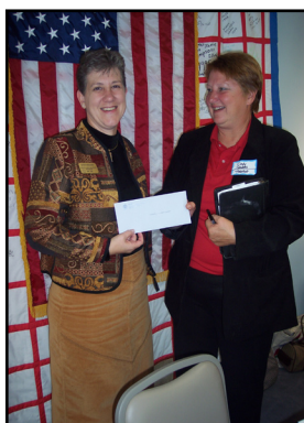
Donation to Picken's County Habitat