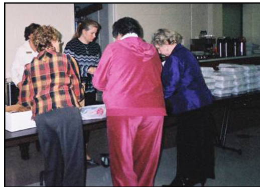
Lunch is Served