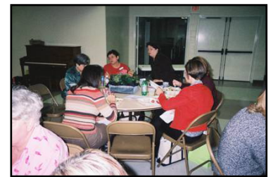
Members working at Winter Board Meeting