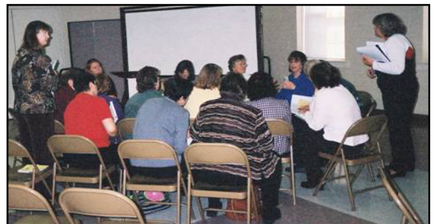
2008 Convention Planning Meeting