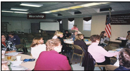
Members at Winter Board