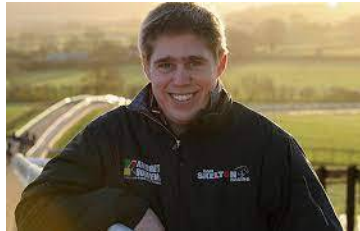
Dan Skelton Racing Autumn 2022