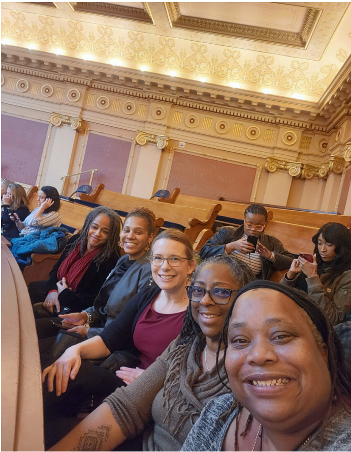
While at the Black Maternal Caucus Members of the Association stand with midwives in support of the Virginia omnibus bill which enhances maternal healthcare access