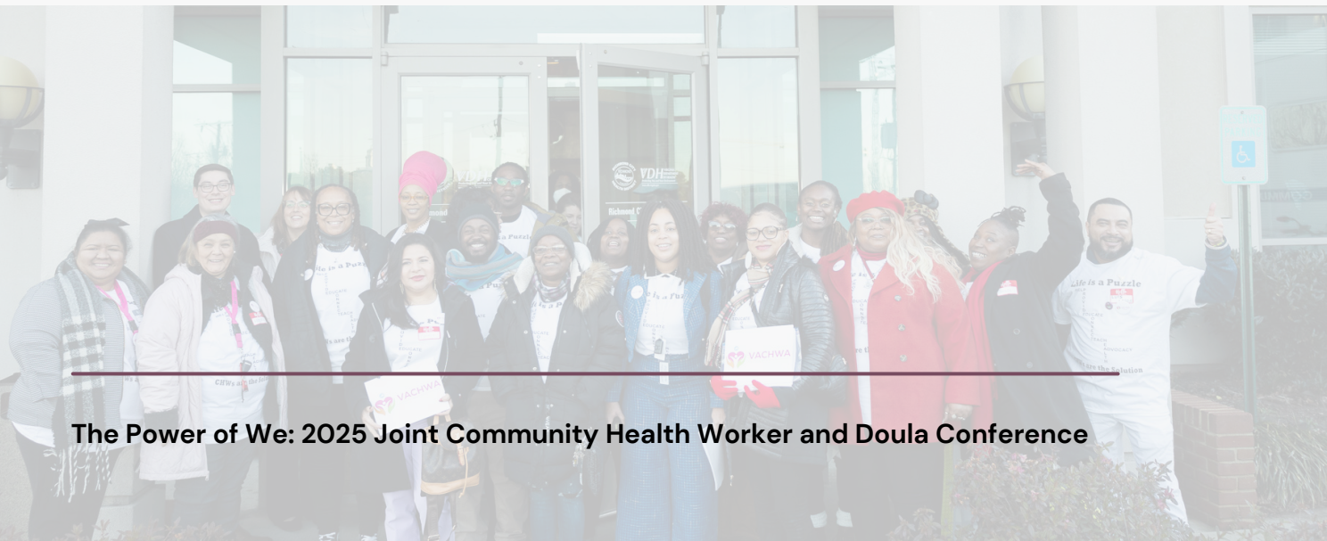
The Power of We: 2025 Joint Community Health Worker and Doula Conference

We offer a variety of sponsorship opportunities designed to highlight your organization's support for health equity, maternal health, doulas, and community health workers. Whether you're interested in premier visibility and recognition, such as having your logo featured on all conference materials, or more targeted engagements like sponsoring a named award at the Awards Ceremony, there's an opportunity for meaningful alignment with this mission-driven convening.