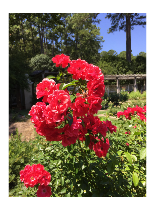
By Lesley Teitelbaum, Ph.D. © 2019