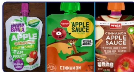
Puré de frutas con canela y manzana WanaBana en paquetes de 3 bolsitas de 2.5 oz.