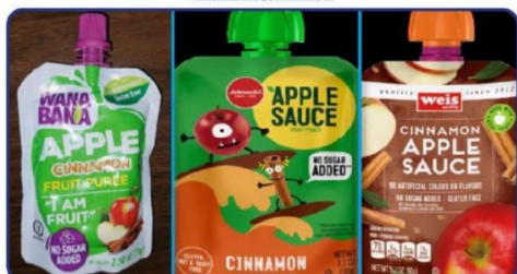
WanaBana Apple Cinnamon Fruit Puree in 3-pack pouches of 2.5 oz.