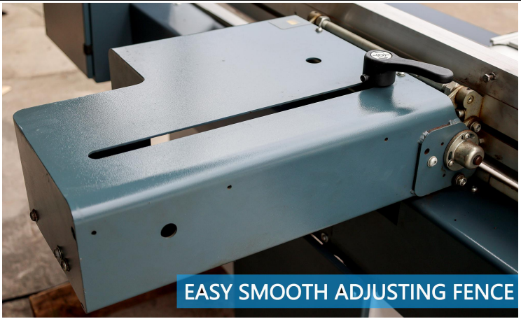
Very smooth and precise sliding fence and be easy adjust to any position and easy to lock