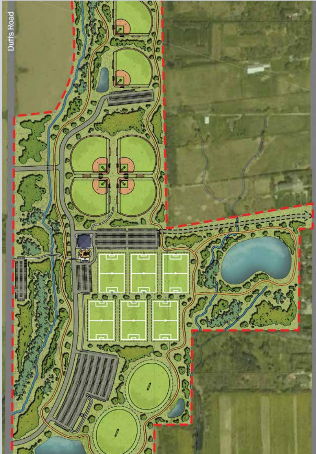
See page 4 for more.