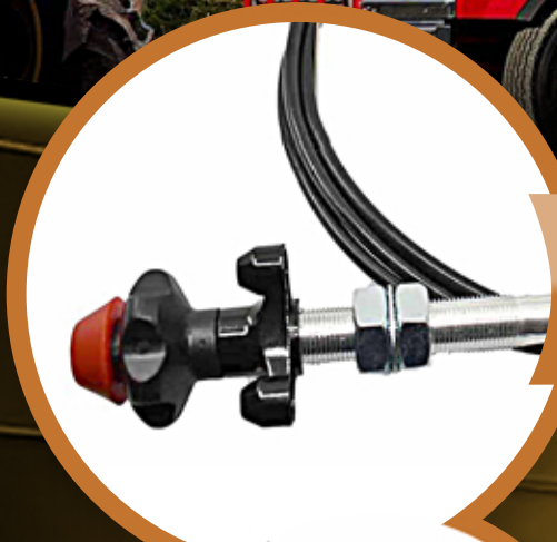
SUPER LOCKING VERNIER • 58 SERIES