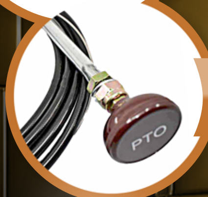
HEAVY DUTY PTO 57 SERIES