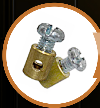
BRASS WIRE STOP • C9