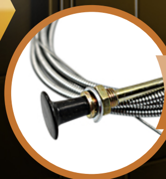
UTILITY 21 SERIES