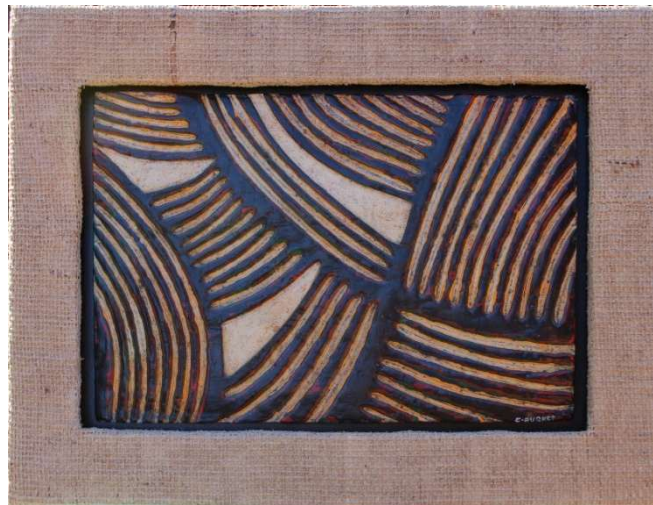
ALL STRIPES TOGETHER iron oxide, beeswax, crayons on stoneware