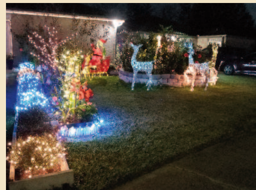
11648 Herald Square