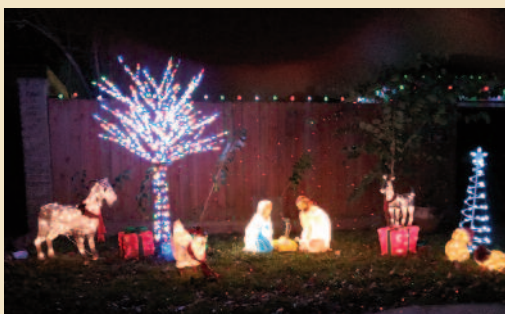
8818 Belle Glen