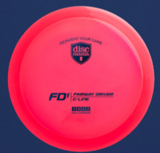
FD1 FAIRWAY DRIVER 7 4 0 2