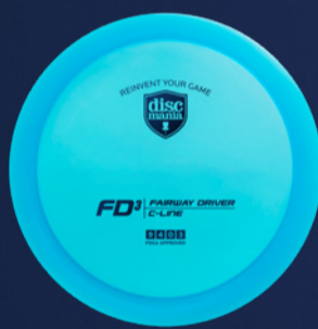
FD3 FAIRWAY DRIVER 9 4 0 3