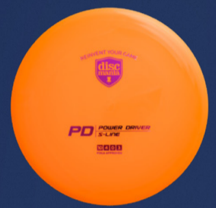
PD POWER DRIVER 10 4 0 3