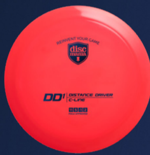
DD1 DISTANCE DRIVER 11 5 -1 2