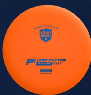
P1 PUTTER 2 3 0 0