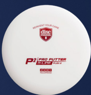
P2 PUTTER 2 3 0 1