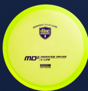
MD3 MIDRANGE DRIVER 5 5 0 1