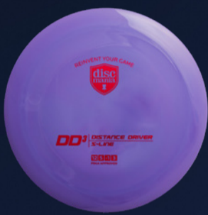
DD3 DISTANCE DRIVER 12 5 -1 3