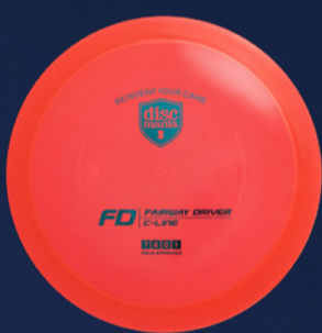
FD FAIRWAY DRIVER 7 6 0 1