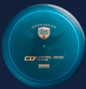
CD1 CONTROL DRIVER 9 5 -1 2