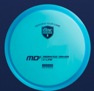
MD1 MIDRANGE DRIVER 5 6 0 0